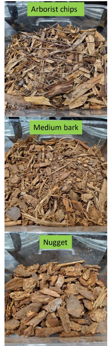
Figure 1: Three types of mulch were tested in bioretention systems

All three mulches preserved more soil moisture than the no-mulch controls. The cells with arborist chips maintained the highest soil moisture readings during the study, experiencing dry conditions (defined for this study as having soil moisture less than 25% water content by volume) only 22% of the study period, while no-mulch control cells