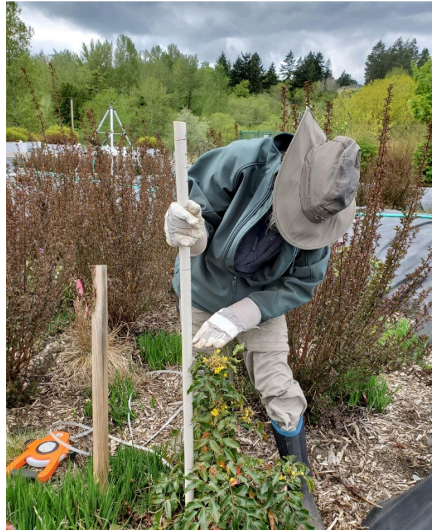
Figure 2: Mulch plays a critical role in maintaining soil moisture, and limiting weeds

Use the plant “ninebark” sparingly in Washington bioretention cells and rain gardens because it spreads rapidly by putting out runners under the mulch, likely requiring added maintenance to prevent it from taking over the bioretention facility.