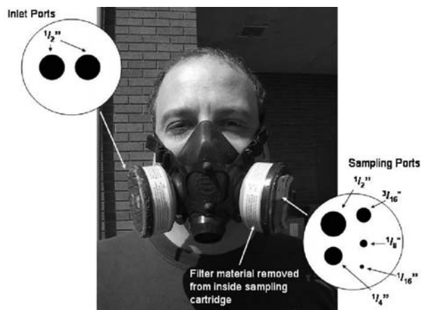
Figure 3. Constructing a facial mask field olfactometer requires respirators and cartridges that can be found at most paint or fertilizer supply companies.

Disadvantages. Panelists using the scentometers have noted some disadvantages; they often mention leaking and poor sealing of the glass nasal inserts. Also, the device does not control or monitor the flow or amount of air inhaled by each panelist when a sample is taken. However, even with these limitations, several states use the scentometer as regulatory tool for monitoring excessive industrial and agricultural odors.