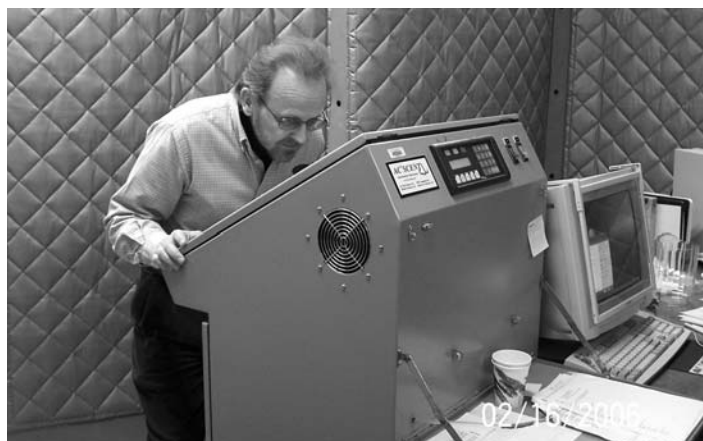
Figure 4. St. Croix Sensory Ac'Scent Olfactometer is portable and costs about $50,000. Labs charge up to $1,000 per sample.

The variability of odor perception and the emission from a source compounds the difficulty of collecting samples representative of the odor emitted. Odor sampling methods vary depending on the type or objective of the sampling being conducted.