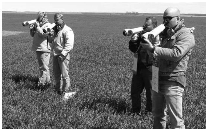
Figure 5. Field sniffers evaluate agricultural odors in southern Idaho using Nasal Rangers.