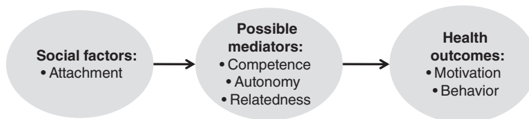
Figure 1. Integration of attachment theory and self-determination theory.

La Guardia, Ryan, Couchman, and Deci (2000) integrated the attachment and self-determination perspectives in their work targeting college student well-being. They found variability in attachment across relationships with mother, father, best friend, romantic partner, roommate and another significant adult. This variability, as well as mean attachment across relationships, was associated with competence,